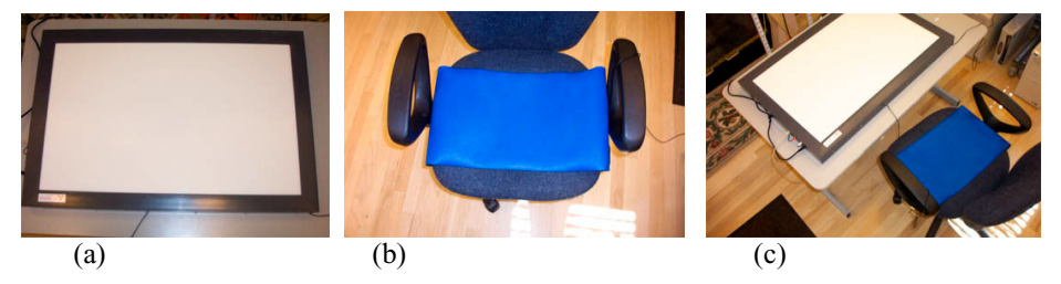
Fig. 1. a) MERL DiamondTouch. b) Conductive mat on chair c) DiamondTouch surface and mat

The DiamondTouch, developed by Mitsubishi Electric Research Laboratory (MERL), is a multi-user touch sensitive input device that allows simultaneous interaction and can identify which user is touching where [0]. The DiamondTouch accomplishes this by using an array of antennas embedded in the touch surface. Each one of these antennas transmits a unique signal. In addition, each user is touching some receiver, a 3M electrostatic mat (Figure 1b) that is placed on a chair. When a user touches the surface of the DiamondTouch, the antennas near the touch point send a small amount of current through the user's body to the receiver mat that the user is sitting on. The current system supports up to 4 users. The unique signal determines where exactly the person is touching the surface. The effective resolution with signal interpolation is about 2550 by 1550, which is about .1 mm of accuracy. However, the projected top-down image has a 1025 X 768 pixel resolution.