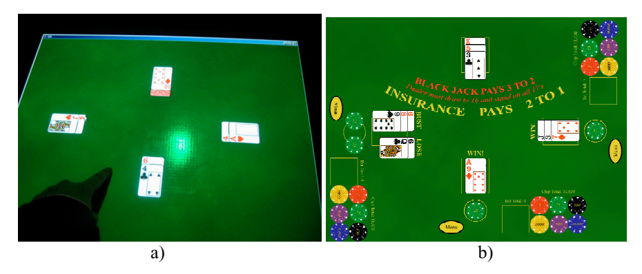
Fig. 4. Photographs of (a) simple Blackjack implementation and (b) Casino Blackjack that includes betting

The digital table can also provide novices with hints and rules as they play the game, making it an ideal learning system. Another interesting extension is the ability to remotely play others with a similar tabletop setup. For instance, a son could play with grandparents at a distance, while still retaining the tabletop metaphor. Now communities can emerge to resurrect long lost card games with this network capability. We are currently developing other multi-player games that require simultaneous interaction with the table such as Poker and Rummy.